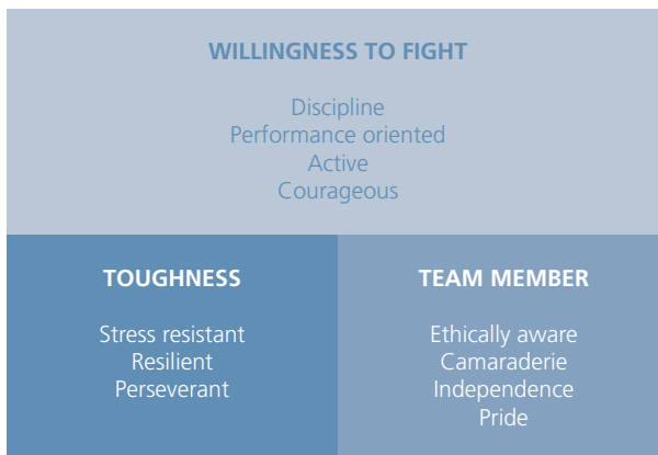
Main elements of mental preparation and training

More than ever, in determining the issue of training and education, the military education institutions should consider the previous level of training, level of motivation, skills, abilities, attitudes of future candidates to the military profession. Learning English and the military operations language by the entire military personnel – by teaching certain modules/courses in English, will almost spread in all NATO countries/partners;